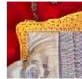
Silk purse with attached mirror by Christine Leddy